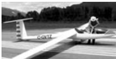
Performance single seater