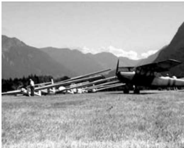
The Club fleet - you too can learn to fly these ships.

Soaring is a wonderfully exciting sport for young and old alike. If you have the desire to fly, then you will fly.