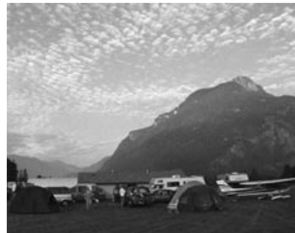
Bring your tent or camper van and stay overnight

And you may find us at altitudes as high as 12,500'